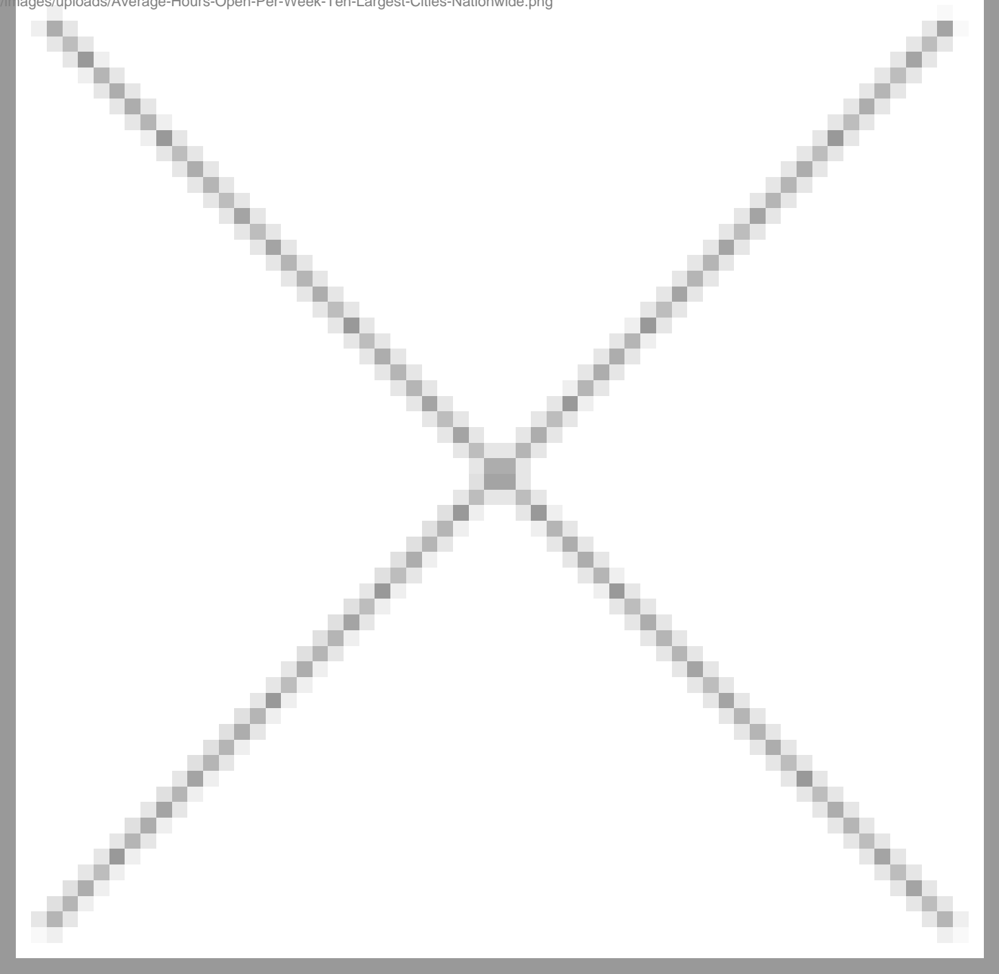
Image not readable or empty /images/uploads/Average-Hours-Open-Per-Week-Ten-Largest-Cities-Nationwide.png