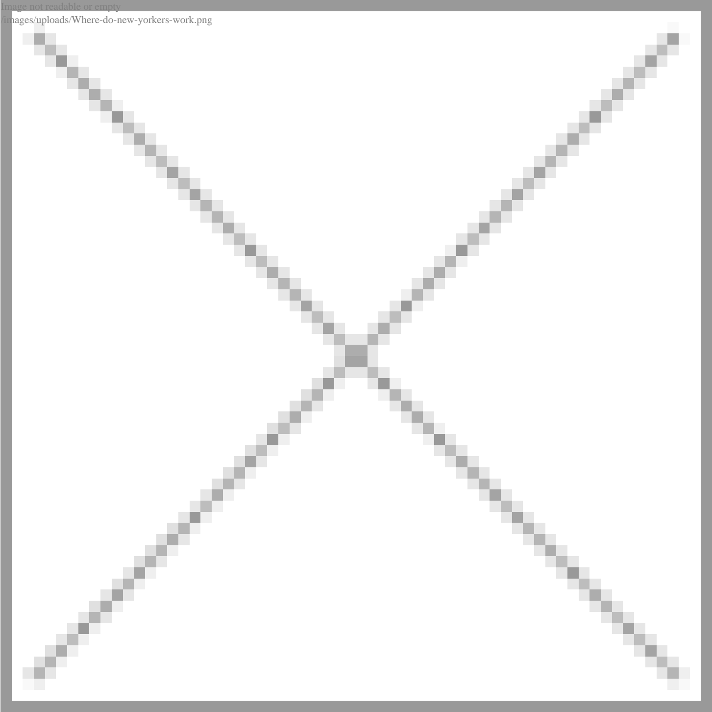
Image not readable or empty images/uploads/Where-do-new-yorkers-work.png